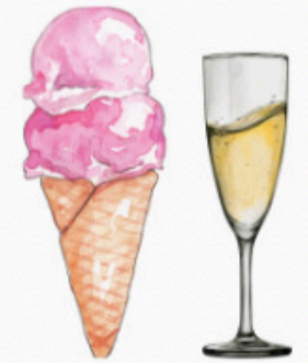
Strawberry + Prosecco