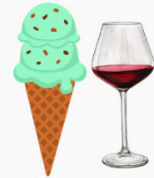
Mint Chip + Merlot