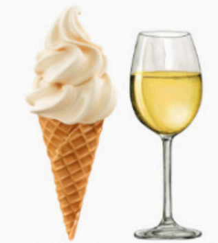
Vanilla + Riesling