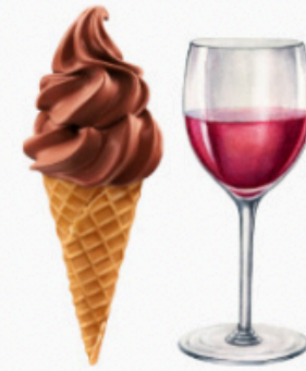
Chocolate + Zinfandel

Enjoy the perfect fusion of local flavors with curated wine and ice cream pairings, designed to highlight the best of Cal Poly's Wine Department and Creamery offerings.